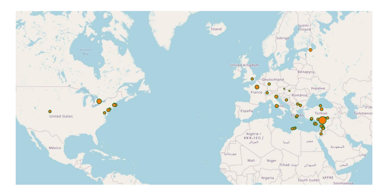
Fig. 3 Late antique and Middle Byzantine objects featuring depictions of personifications of abstract ideas identified via a Greek name label: current location, when known (map created via <a href="recogito.pelagios.org">recogito.pelagios.org</a>)

Thus, the 'transnationality' of images such as this occurs on two levels: first, in respect of their country of origin and second, in respect of their current location. Analysing these artifacts as a group often requires a 'transnational' approach, i.e., going beyond the national boundaries of the modern countries they were found in as well as of the countries they are now located in.