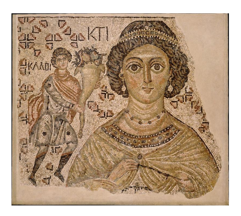
Fig. 1 Fragment of a Floor Mosaic with a Personification of Ktisis, 500–550, with modern restoration, 151.1 x 199.7 x 2.5 cm. New York, Metropolitan Museum of Art.

Furthermore, while Burcu Dogramaci argues for "an understanding of art history as a history of movement," considering the mobility of artists and their subjects in respect to contemporary art,<sup>4</sup> these are aspects that are equally relevant for earlier periods. Late antique iconographies and motifs themselves can be inherently mobile and 'transnational,' as is the case of the image of Ktisis, personification of foundation. She is often depicted as a bejewelled young woman and can only be identified via a Greek name label next to her head, for example as in a 6<sup>th</sup>-century floor mosaic now in the Metropolitan Museum of Art in New York (MET) (Fig. 1).